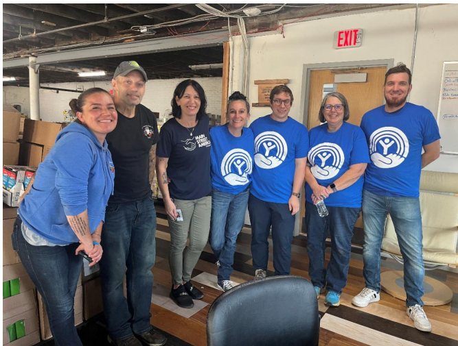
A volunteer group from Main Street America Group helps out at The Community Kitchen

In the true spirit of Teaming Up for Tomorrow , right after our kickoff event on September 12, eight corporations and organizations engaged in a Day of Caring. Volunteer teams from Electric Imaging Materials , Fenton Family Dealerships , Keene State College , Antioch University , M&T Bank , Main Street America Group , Monadnock United Way , and Savings Bank of Walpole rolled up their sleeves and completed needed projects at seven local agencies.