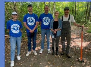
The team from Fenton Family Dealerships landscaping at Monadnock Family Services!