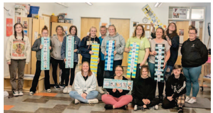
Pyramid Model workshop attendees showing off their visual cue boards.