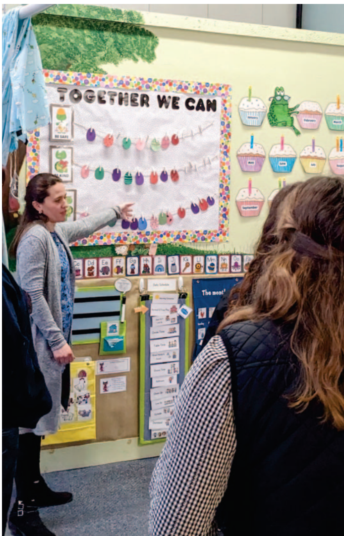
Teacher leading a Pyramid Model session on friendships

Finding affordable, high-quality childcare is a daily struggle for working families in the Monadnock Region. Long waitlists and staffing shortages in early childhood programs can create challenges for parents. Monadnock United Way (MUW) and Keene State College (KSC) are leading the Child Care Expansion Task Force in the federally funded* Child Care Expansion (CCE) project, designed to create a thriving local environment for children, staff, and families.