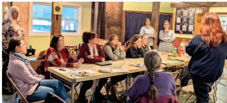
Early learning professionals listening to a Pyramid Model presentation