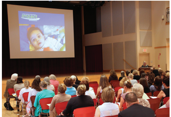
Over 200 early childhood supporters attended the Early Childhood Summit: The Seven Essential Life Skills Every Child Needs at Keene State College.